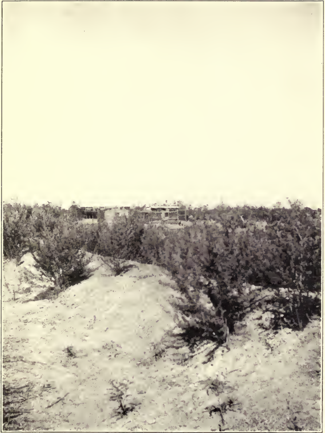
“ON THE FRONTIER OF CIVILIZATION” (The huts in the background are on Mexican soil)